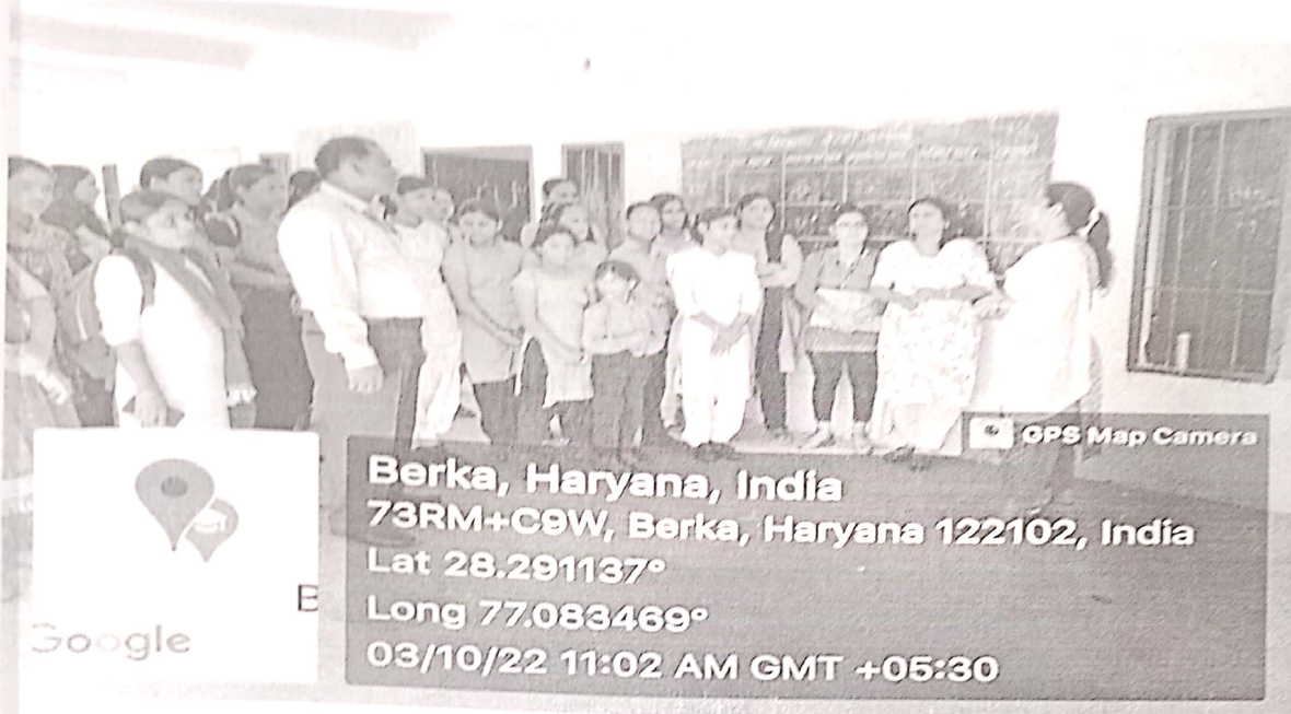
Picture 3: Faculty of SOED interacting with students regarding various cleanness activities