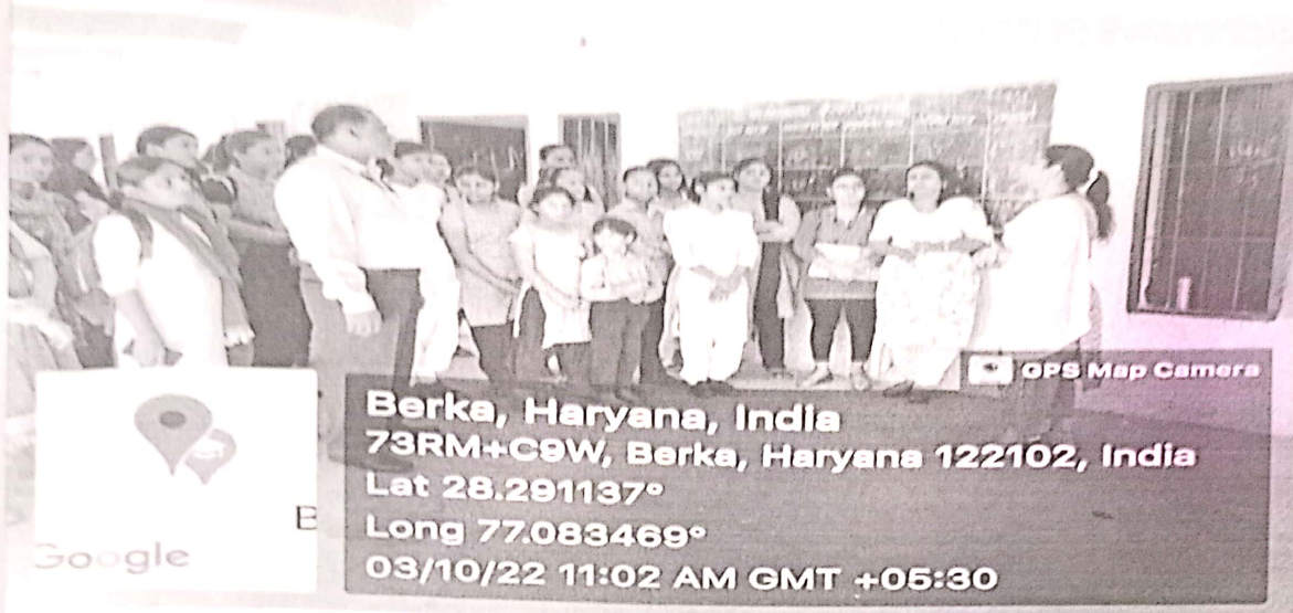
Picture 5 : Student-teachers and faculty of SOED interacting with students and faculty members of the school.