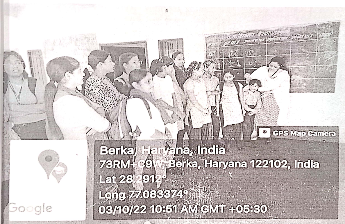
Picture 4: Faculty of SOED interacting with students regarding various cleanness activities