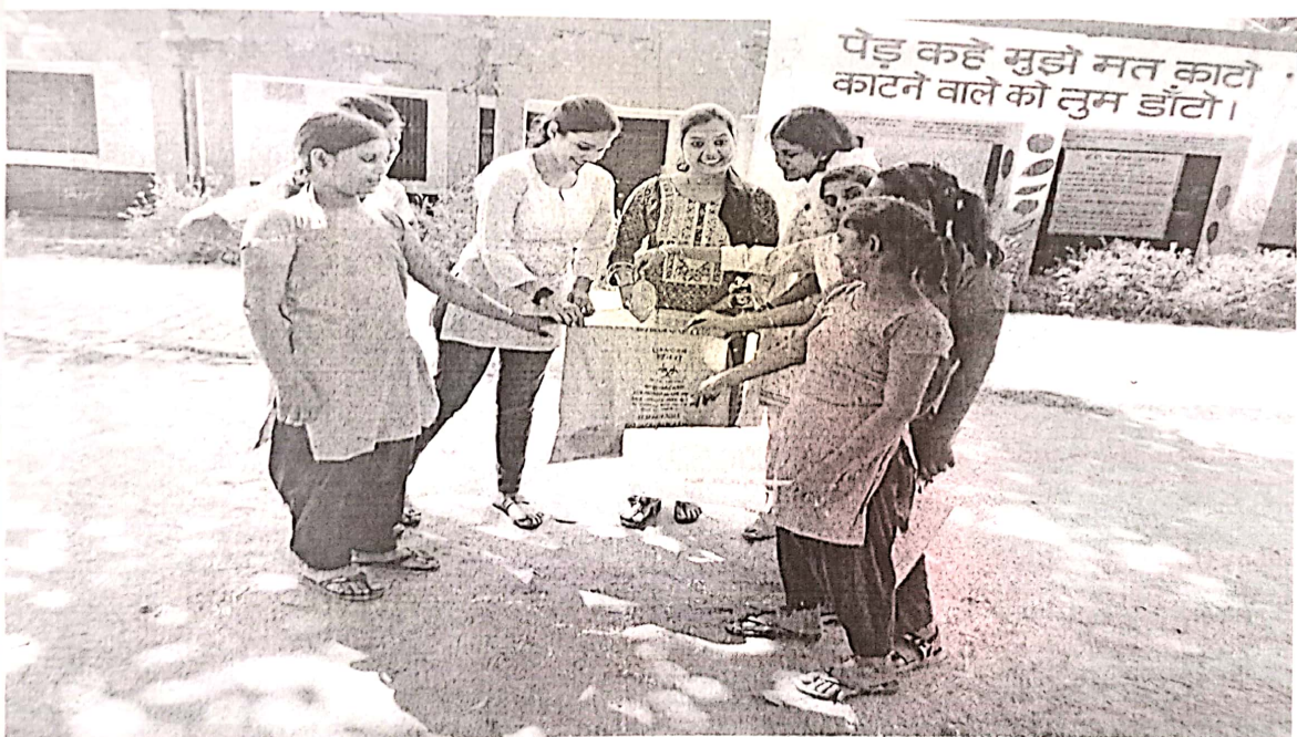
Picture 6: Student engaged in cleanness activities to clean the school campus