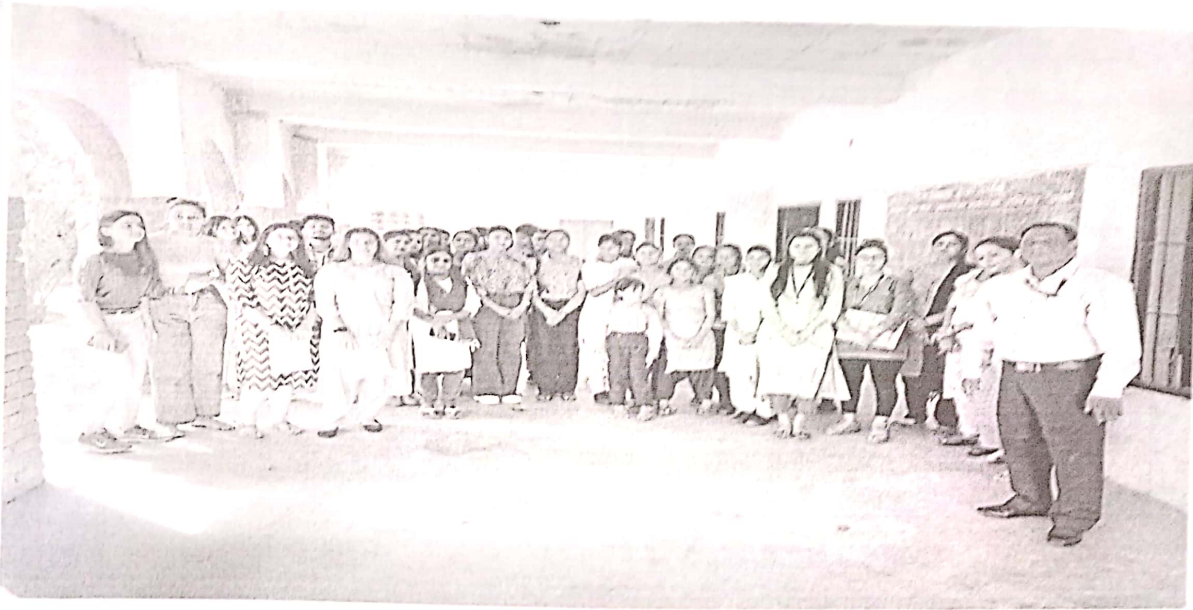
Picture 1: Student-teachers and faculty of SOED interacting with the school students