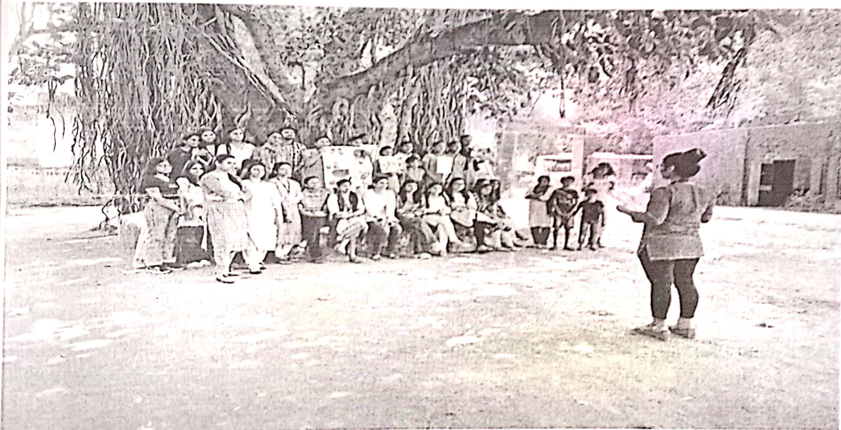
Picture 2: Student-teachers of SOED discussing advantages of various cleanness activities